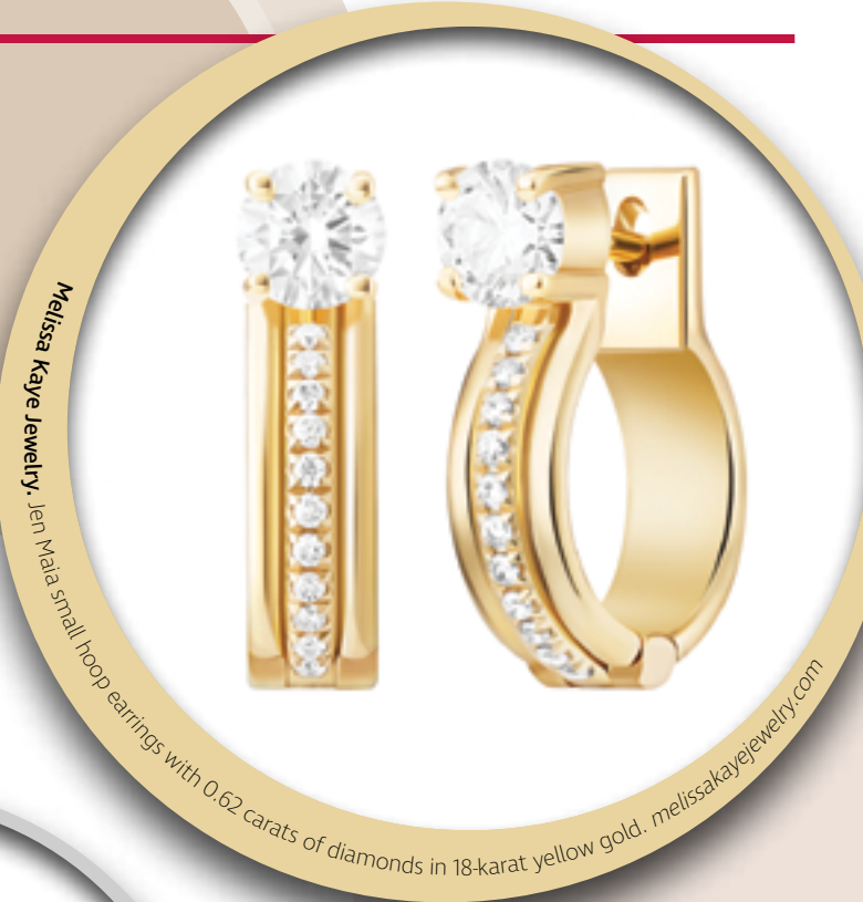
Melissa Kaye Jewelry. Ten Mala small hoop earrings with 0.62 carats of diamonds in 18-karat yellow gold. melissakayejewelry.com