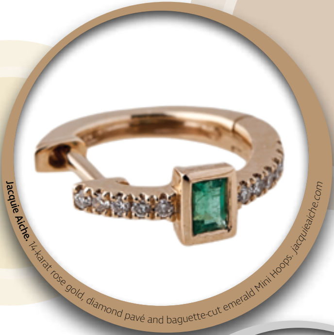
Jacque Aiche. 14-karat rose gold, diamond pavé and baguette-cut emerald Mini Hoops. jacqueaiche.com