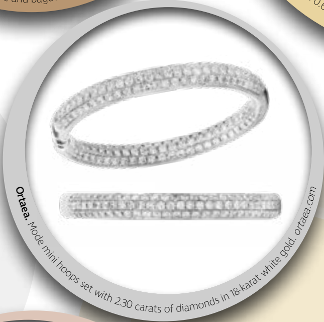
Ortea. Modè mini hoops set with 2.30 carats of diamonds in 18-karat white gold. ortea.com